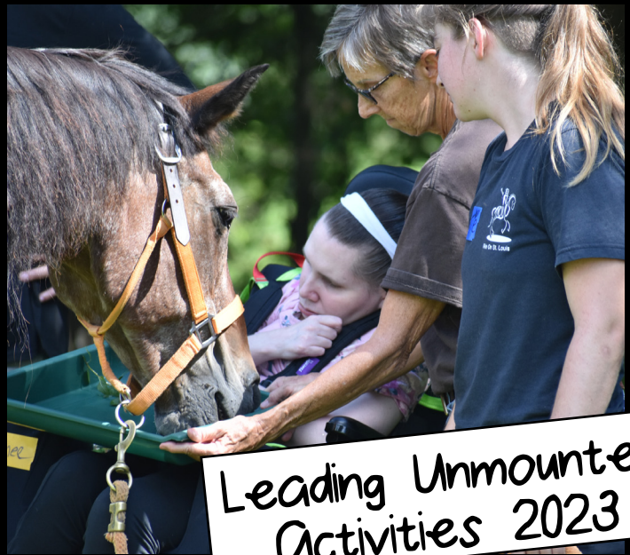
Leading Unmounted Activities 2023